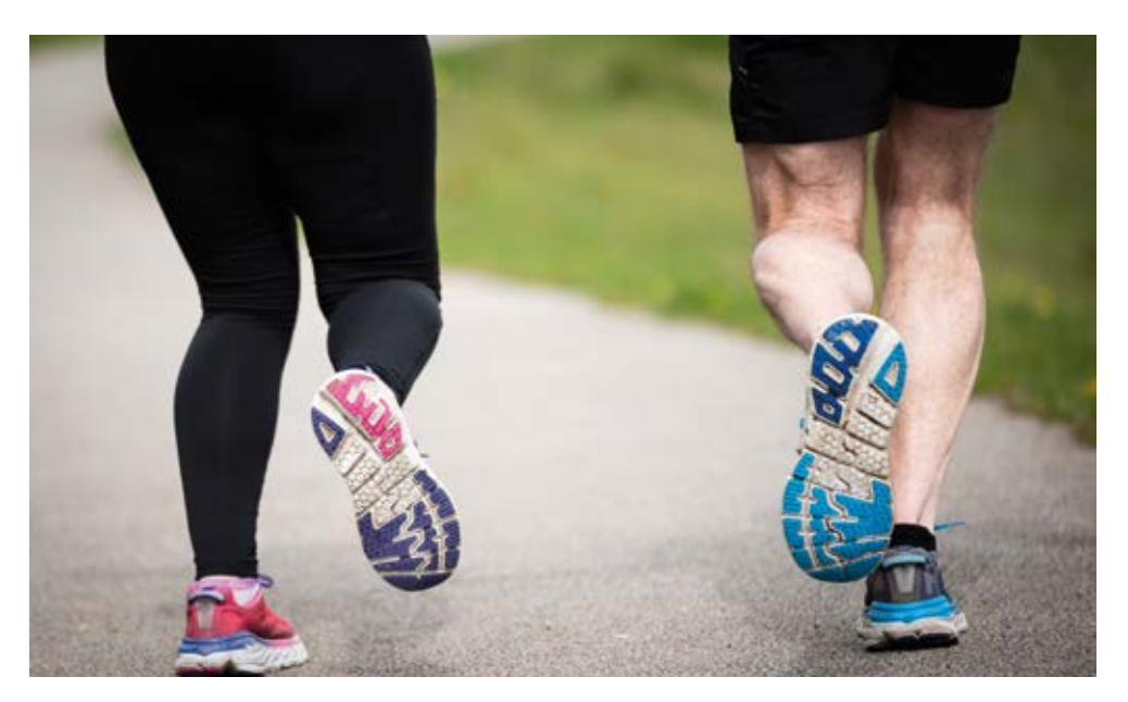
Disclaimer : The information in this newsletter is not intended to be a substitute for professional health advice, diagnosis or treatment. Decisions relating to your health should always be made in consultation with your health care provider. Talk to your chiropractor first.

Are sore knees holding you back from running? Read the companion article in this edition: Are your knees letting you down?